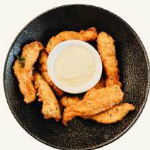
Finding Dory Fingers battered dory fish fingers served with lime mayo