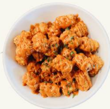
Crispy Tater Tots w/ Smoky Sauce fried tater tots, smoked paprika, mayo & honey