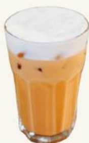
Iced Thai Milk Tea red thai milk tea, cream foam