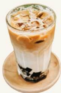
Iced Coffee Jelly Latte espresso, milk, housemade coffee jelly